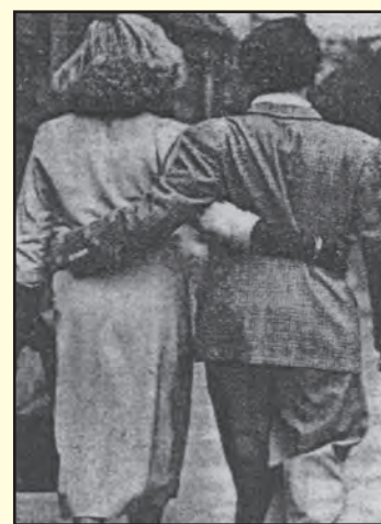
'This sort of thing – walking with arms around each other's waist – is considered to be wrong in many quiet British towns.'