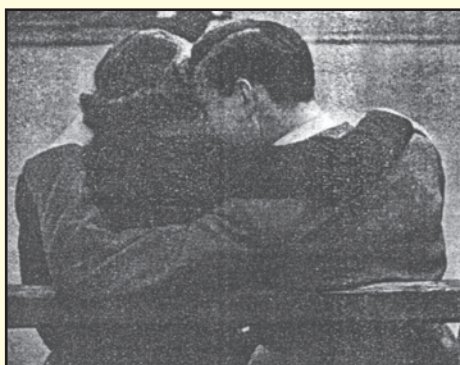
'Necking in the park. A common enough scene in London and other big cities. But some towns would be shocked, for all boy-and-girl behaviour in public must be restrained.'