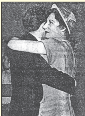
'Dancing cheek to cheek ... Immoral or harmless? Again there are wide differences of opinion throughout Britain.'

This was the title of an article in the Sunday Pictorial of 31 July 1949 concerning the Mass Observation study. 'Those who say our moral standards are getting better attribute the improvement to increasing sex knowledge and freedom of behaviour. Those who say they are worse describe incidents they have read about with disgust.' These photographs and their captions give an idea of the sort of behaviour that disgusted people in 1949.