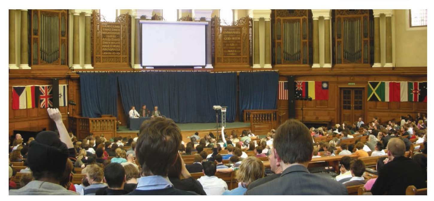
The conference in full swing